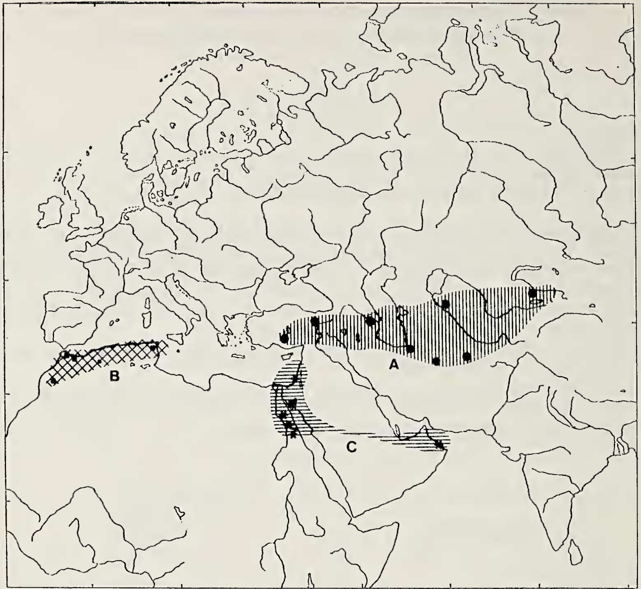
Fig. 6. Geographical distribution of Paracrocisa Alfken, with indication of known localities; A, P. kuschakewiczi (Radoszkowski); B, P. guilochei (Dusmet); C, P. sinitica Alfken.

Paracrocisa was characterized in some detail in a recent paper on Old World Melectini (Lieftinck, 1972). So far only three closely allied species have become known, and redescrptions and illustrations of these can be found in the article just mentioned. The bees of this genus superficially resemble certain eastern Melecta fairly closely, viz M. corpulenta Morawitz and transcaspica Morawitz, which form a small group within that genus. Females of the latter are, however, characterized by very short decumbent abdominal tomentum, close and fine body punctation, hairless areas on thoracic dorsum, and some other peculiarities. All are early spring species which occur together with Paracrocisa in several localities. Apart from the modified leg structure and very differently shaped sternal plates and copulatory organs, Paracrocisa can be most easily distinguished from Melecta by the long slender antennae and short labrum. Other differences will be pointed out in my forthcoming revision of the genus Melecta .